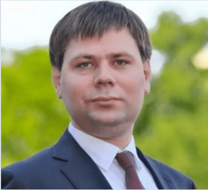
Vasyl SHKURAKOV, Acting Minister for Communities, Territories and Infrastructure Development:

The renovated water supply facility in Bucha is another example of what we can achieve through joint efforts with our EU partners. This project provides quality drinking water to thousands of residents and represents a significant step towards rebuilding and strengthening our municipal infrastructure. With continued collaboration, we can ensure that communities across Ukraine have access to essential services and a better quality of life.