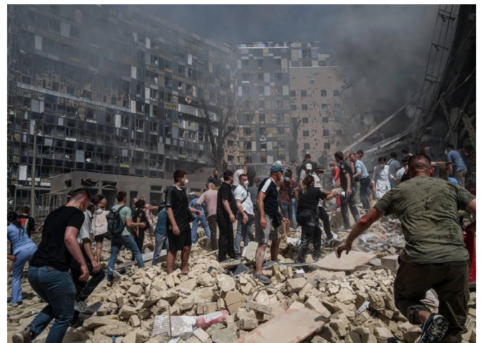
The largest Ukrainian children’s hospital destroyed by a russian missile on July 8th in Kyiv.

*As of July 12th, 2024, according to regional military administrations since February 24th, 2022