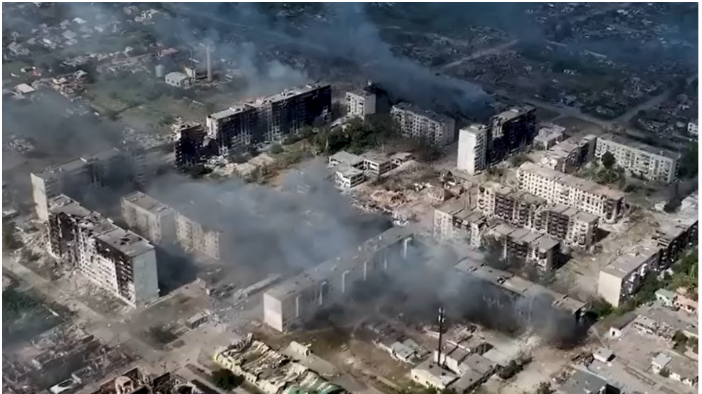
Vovchansk, the Kharkiv region. Hostilities destroyed the town in June 2024.

The Government of Ukraine has decided to record damage to buildings and structures in the areas of active hostilities