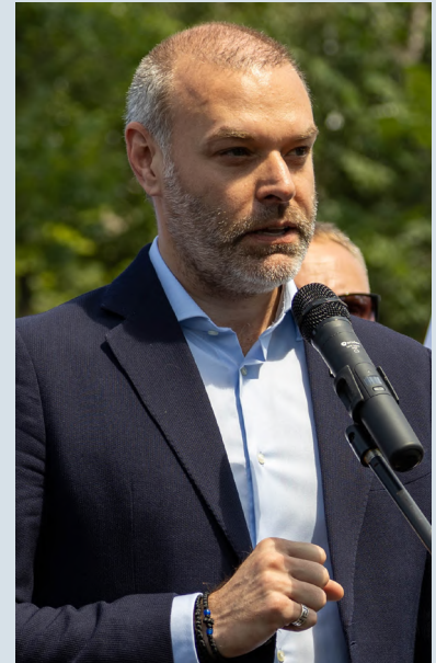
Rémi DUFLLOT, Deputy Head of the EU Delegation to Ukraine:

The revival of Bucha is a testament to its people's resilience and the power of collaborative efforts. By restoring essential infrastructure like this water supply facility, we're not just rebuilding structures but hope and trust within the community. The UNDP, alongside our partners, is dedicated to ensuring that every community in Ukraine can recover and thrive, even in the face of adversity.